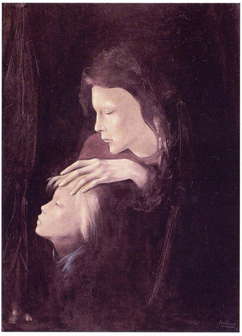
MOTHER AND SON, 1977.

ure institutions are needed; there are not the means to arrange proper assistance to children in need or with problems; there is a need for training for professionals such as judges who have to deal with children. A separate issue is the attention that should be given to the family, which is responsible for the child's well-being and upbringing. In another order of things, children (I have already said what is understood by "child") are not listened to when it comes to things that affect them. Their opinion is taken into account, because the law says it must in certain questions such as adoption, but we can hardly speak of participation.